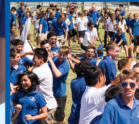
A GLIMPSE AT INHALE 2015

WELCOME BACK! WATCH D.O.G.S. CONQUERORS IN ACTION