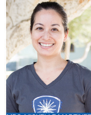
MRS. MICHELLE MARTINEZ PRESCHOOL