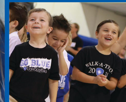
WORSHIP AT HEBREWS & CHAPEL